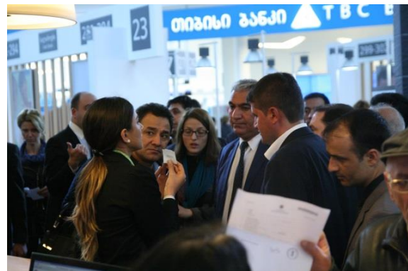
Study Visit on Migration Management in Georgia

Through a combination of components, the improvement of basic structures for migration management and competences in the Silk Routes countries is targeted by approaching the issue from three necessary angles: capacity (training), information and policy , which will together raise the capacity of migration authorities in the region. These three basic components are flanked by policy intergovernmental dialogue at all levels and new skills gained will be put into practice in pilot projects .