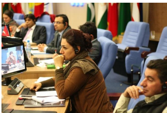
Regional Training on Legal/Labour Migration in Iran

Combined with the development of training programmes, training of trainers and technical assistance shall contribute to (a) improved knowledge, common understanding and strengthened training structures on migration matters and (b) enhanced frameworks for interagency cooperation and peer-to-peer contacts