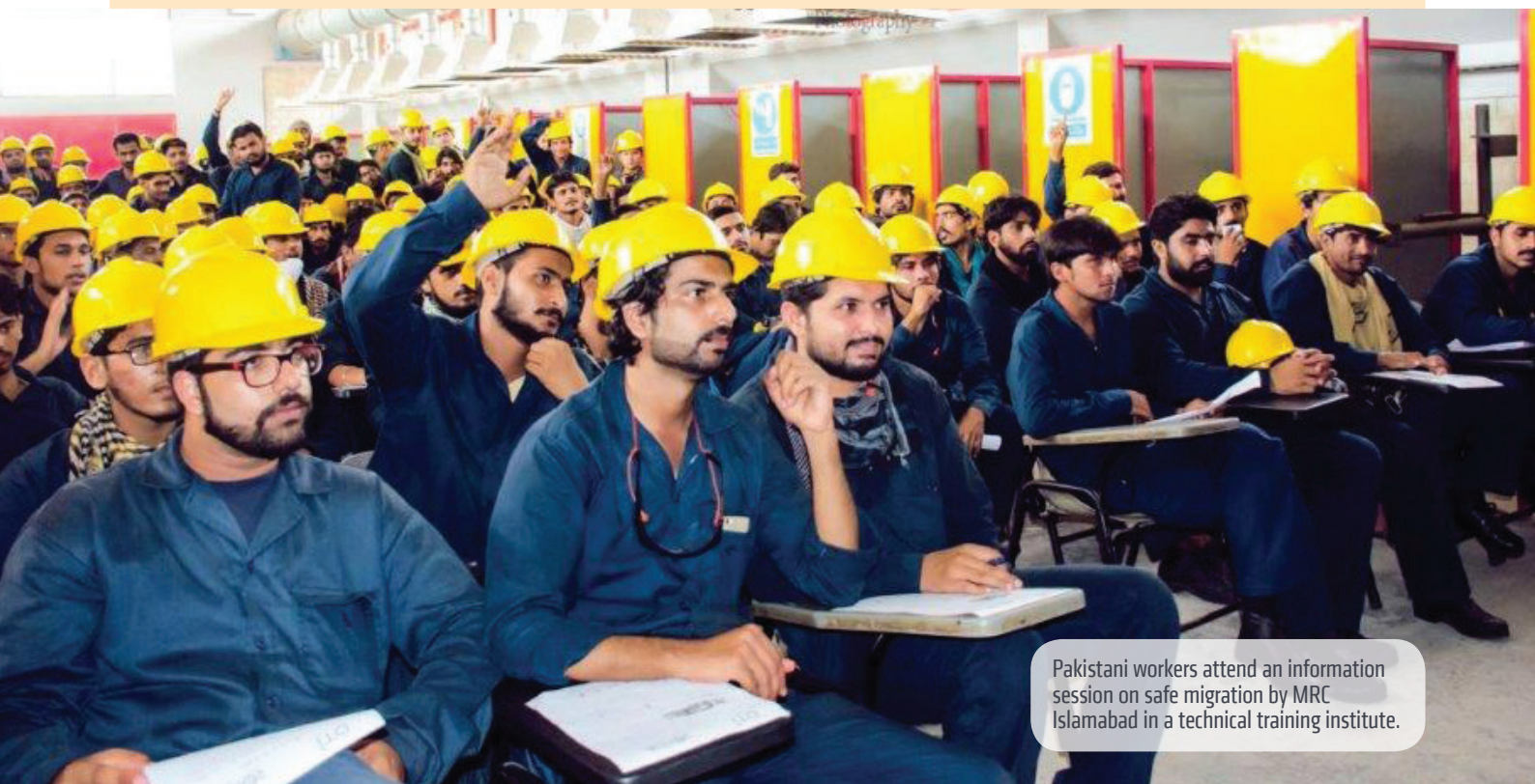
Pakistani workers attend an information session on safe migration by MRC Islamabad in a technical training institute.